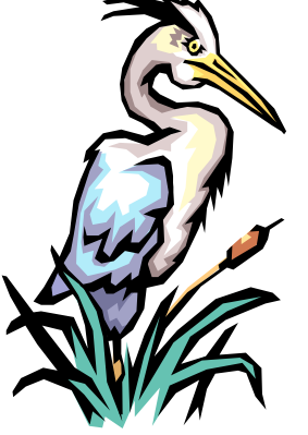
September 15, 2008