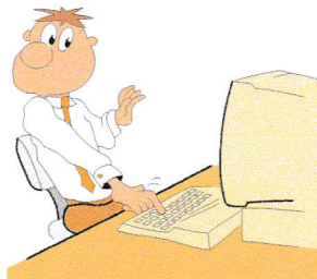
From the Chair

----- If we have your Email Address, we can send you bulletins. Please send your email to horseheadlakePRD@gmail.com -----